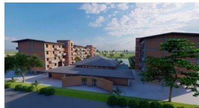
HOSTEL & MESS BUILDING

Some of the pictures from on-going construction activities (Main Campus, Mangaldai):